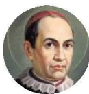
ST. ANTHONY MARY CLARET

Lord, by the words of consecration the substance of the bread and wine is converted into the substance of your Body and Blood. All powerful Lord, say over me the word which will change me into You.